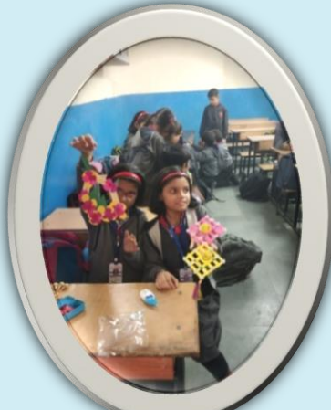
Wall Hangings Making