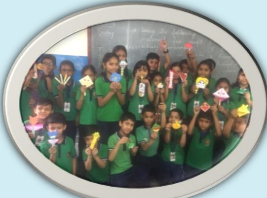
Book Mark Making

Co-curricular activities are an essential part of school life & helps in enhancing the learning process of students in school. Our schools organize CCA activities every week and children love to participate and win prizes.